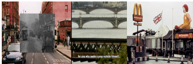
Fig. 01. Film stills from City of the Future and London by Patrick Keiller

Keiller is principally known for a collection of films, The Robinson Series that use an imaginary narrative and narrotor to focus on London - on architectural, political, and social trends related to consumerism, conservatism, globalization, and individual identity in urban society. His work, illustrated in Figure 01, combines archival footage with a pseudo-documentary style, what he calls “an attempt at some sort of hyperreality.” 2