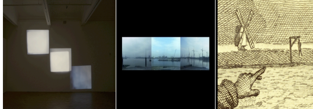
Fig. 02. Film outtakes from Diagonal , Thames Barrier , and Thames Film by William Raban

Raban's films are known for pioneering examples of multiple-screen and multi-media techniques developed as a "reaction against the fixed single screen of traditional cinema." 3 Raban's work, illustrated in Figure 02, grew from an his art/painting background and evolved during the 1970s and 1980s toward a pseudo-political body of work that chronicled historical and contemporary events in an attempt to "create some meaning of the condition of the country." 4