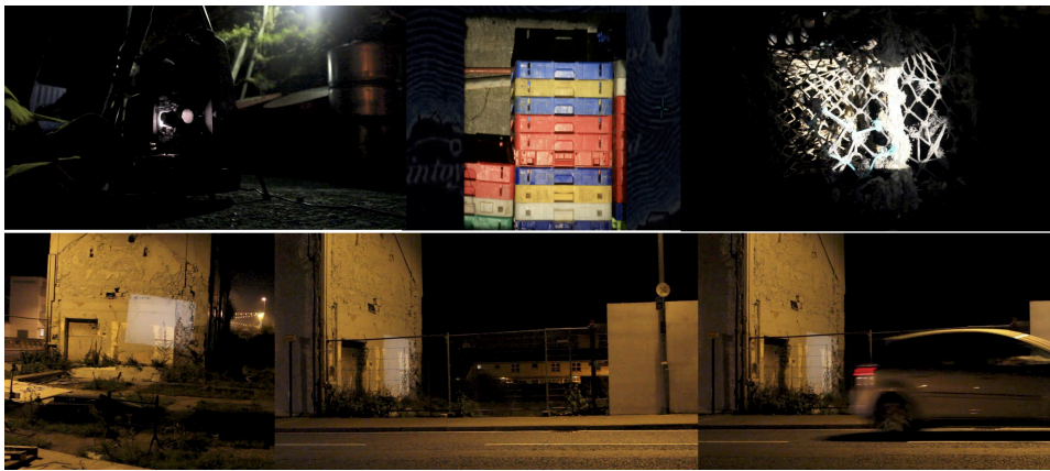
Fig. 04. "Elmo" An MArch student experiment in expanded cinema

The influence of the first stages was an immediate move to experiment and try to apply different techniques without as much perceptible pre-judgement as the first films. One group of students took it upon themselves to purchase a used 8mm projector, immersing themselves in the town over a couple of days. Their example in Figure 04 draws heavily on Raban's Diagonal , projecting an analog square of light onto selected surfaces that is captured through the digital process.