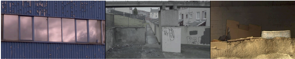
Fig. 03. Film outtakes from Empty , Remains , and Segura by Willie Doherty

Doherty's work, illustrated in Figure 03, varies from landscape to urban settings and often incorporates long focused images, filmic photographs, sometimes with natural sounds, and other with voiceovers, and layers of text and image, "which creates a sense of ambiguity and plays on the viewer's prejudices and assumptions." 5